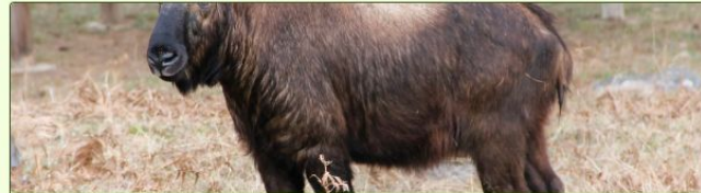
Takin - Bhutan