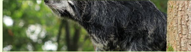
Binturong - Philippines (Palawan)