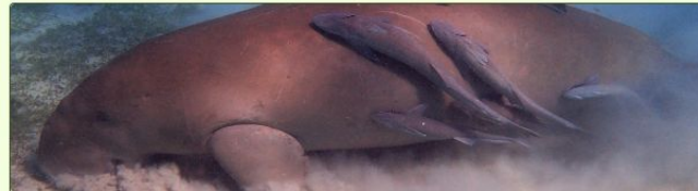
Dugong and grazing zones - Japan (Okinawa)